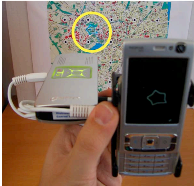
Figure 1: Prototype of a Map Torchlight unit in use. The castle of the City of Münster, Germany, is highlighted with a frame of white light (marked in the figure with a yellow circle). By clicking the center of the 4-way button on the phone the user can access detailed information about the castle history on the phone screen.